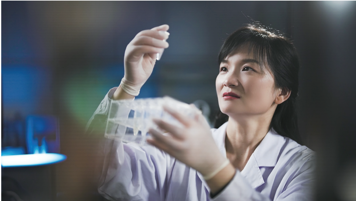
FU preparing samples for the auto pipeline.

contributed to the genetic makeup of present-day East Asians, Austronesians and Native Americans.