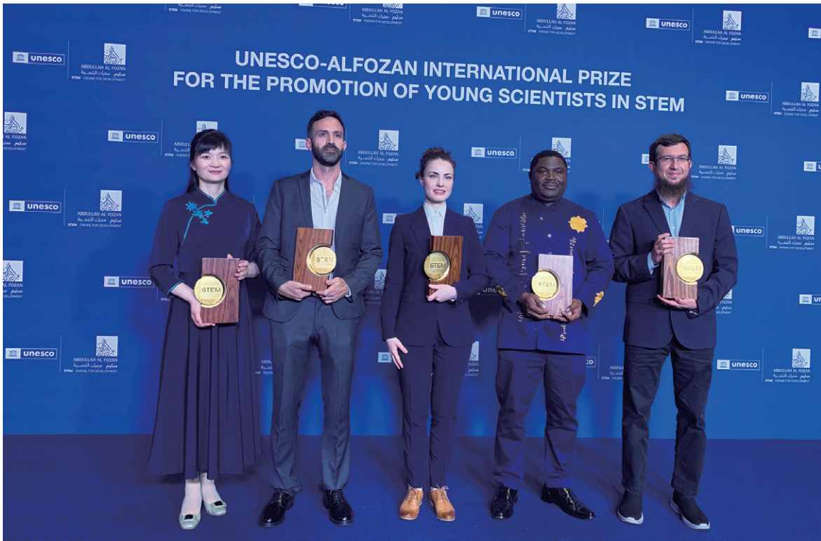
FU poses with other four laureates.