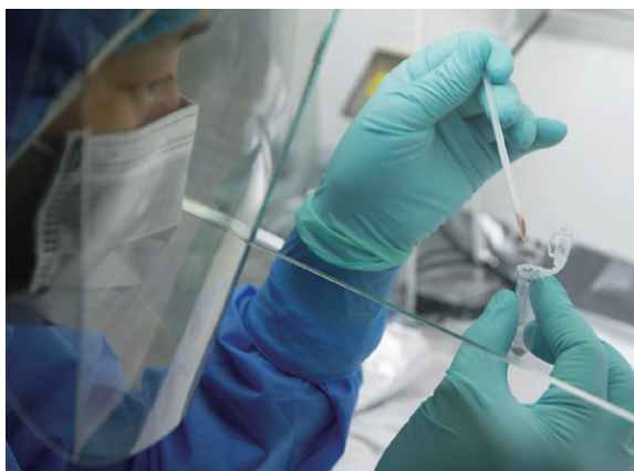
FU works at the lab.

FU also led a team that decoded the world’s and East Asia’s earliest modern human genomes, shedding new light on the genetic exchange between archaic and modern humans, and deeply elucidated the dynamics of East Asians over the past 40,000 years. In so doing,