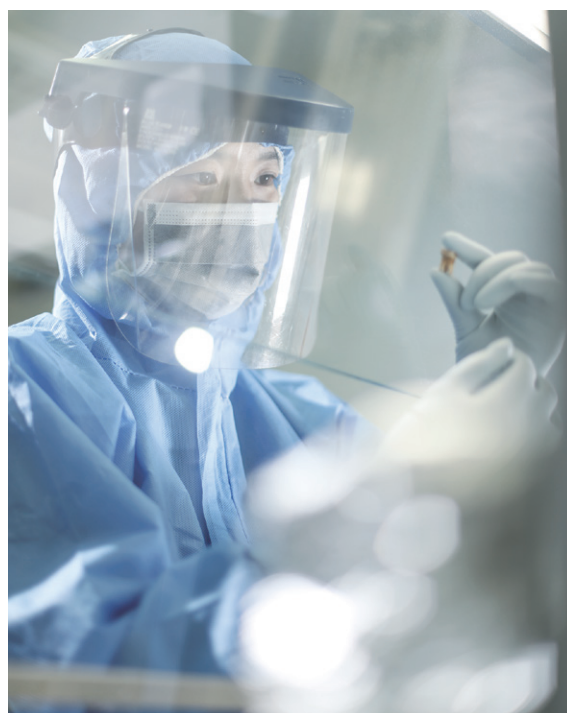
FU works at the lab.

FU also discovered many unique, unknown human lineages whose ancestries are not found today. In addition, she showed how some other ancestral lineages, such as northern and southern East Asians, greatly