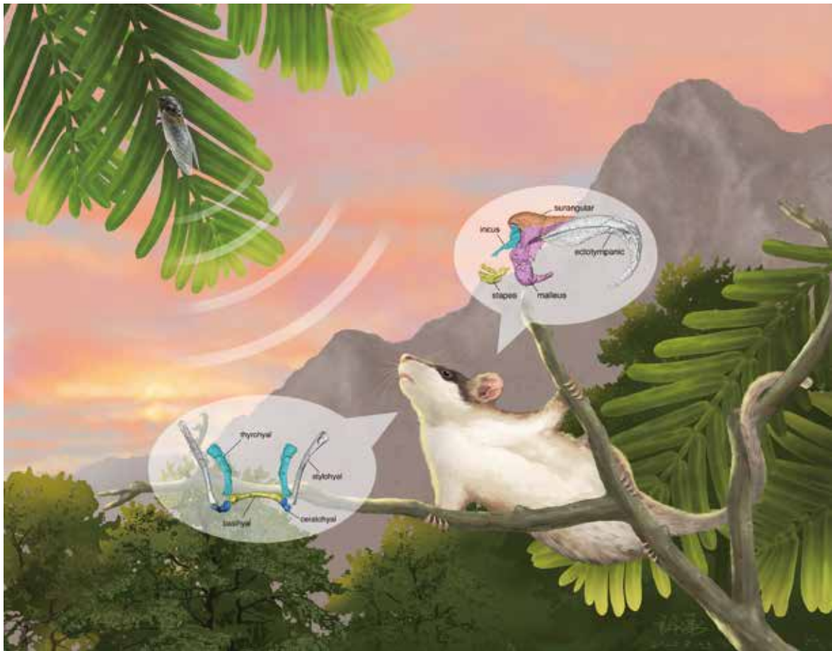
Figure 2: Reconstruction of Sinobaatar pani (Image by IVPP)

Multituberculates are an extinct group of mammals that lived from the Middle Jurassic (about 165 million years ago) to the Eocene (about 35 million years ago). The most exciting discovery about the new animal is its middle ear bones, which are the first unequivocal evidence of the five auditory bones from this extinct mammalian group.