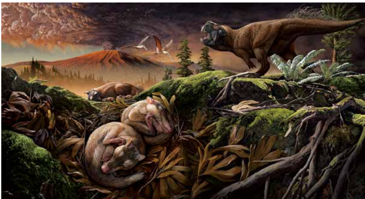
Fig. 3 Reconstructed environment when Origolestes lili died at rest (Credit: Chuang Zhao).