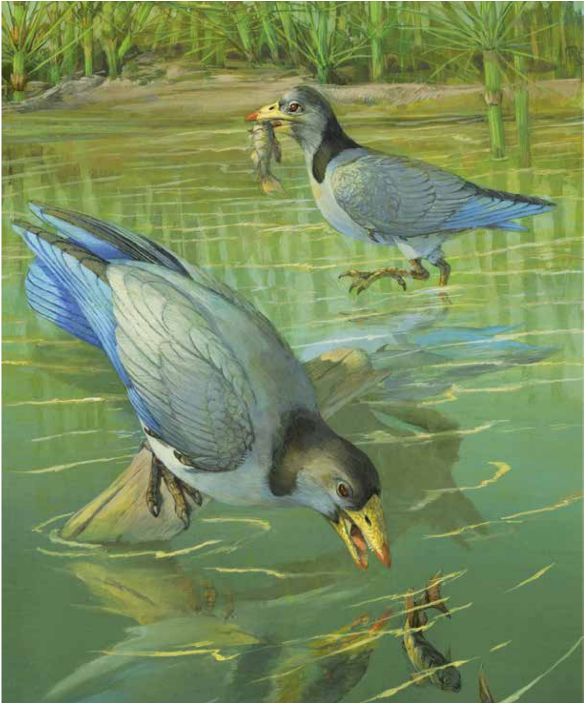
Reconstruction of Yanornis martini feeding on fish along a shallow lakeshore of the Jehol biota. (Image by Michael Rothman)