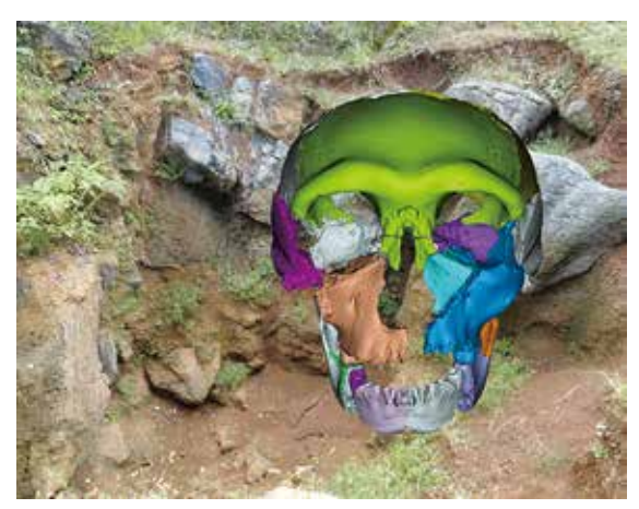
Figure 1: The Hualongdong Middle Pleistocene human skull and the collapsed cave site, with the fossil-bearing breccia in beige aournd the limestone blocks.

Excavations in Middle Pleistocene cave deposits in southeastern China yielded a largely complete skull that exhibits morphological similarities to other East Asian Middle and Late Pleistocene archaic human remains, but also foreshadows later modern human forms. Fossil evidence for human evolution in East Asia during the Pleistocene is often fragmentary and scattered, complicating efforts to evaluate the pattern of archaic human evolution and modern human emergence in the region. WU Xiujie and colleagues reported the recent discovery of most of a skull and associated remains dating to around 300,000 years old, in Hualong Cave (Hualongdong). The features of the Hualongdong fossils complement those of other East Asian remains in indicating a continuity of form through the Middle Pleistocene and into the Late Pleistocene. In particular, the skull features a low and wide braincase with a projecting brow but a less prominent midface, as well as an incipient chin. The teeth are simple in form, contrasting with other archaic East Asian fossils, and its third molars are either reduced in size or absent. According to the authors, the remains both add to the expected variation of these Middle Pleistocene humans, recombining features present in other individuals from the same time period, and foreshadow developments in modern humans, providing evidence for regional continuity.