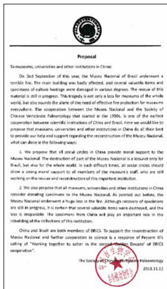
The Written Proposal for supporting MN as released at the closing ceremony of the 16 th Academic Conference of SVPC November 12 in Hefei, Anhui, China.