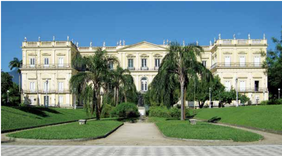
The main building of the National Museum of Brazil as it looked in 2011. It used to be the residence of the Portuguese Royal Family and the Brazilian Imperial Family.

This appeal, which was made at the closing ceremony of the 16 th Annual Meeting of SVPC, held in Hefei, capital city of Anhui Province of China, marks the latest move of Chinese paleontologists in supporting MN.