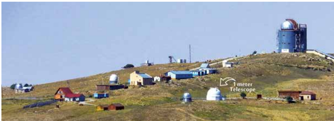
A general view of the Maidanak Astronomical Observatory with the 1-m telescope tower.

As a result of over 30 years of intensive studies, a major work entitled Zij of Ulugh Beg ("Zij" means astronomical treatise) was compiled by Samarkand's astronomers. The most important part of the Zij was a catalogue of 1,018 stars. It was the first observational