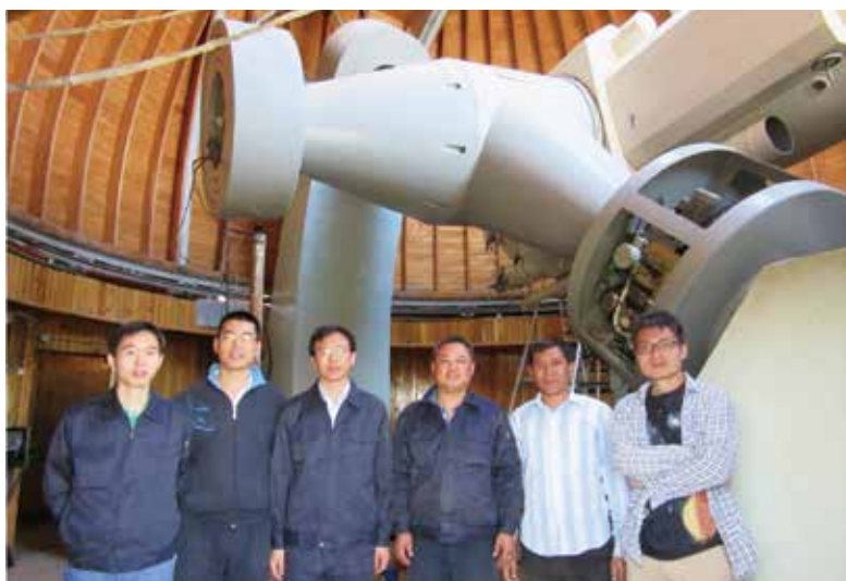
Chinese and Uzbek experts work together on the upgrade of the 1-m telescope.

catalogue to be compiled since the 2 nd century when Ptolemy reproduced the Hipparchus catalogue in his Almagest .