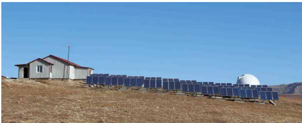
With joint efforts of NAOC and UBAI, a 20kW solar power station was launched at Maidanak Observatory for uninterrupted power supply of the 1-m telescope.

We hope that Chinese astronomers will be interested in joining this project in order to further