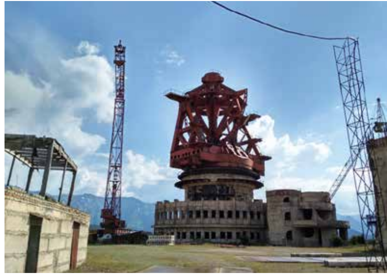
The 70-m radio telescope RT-70 at Plateau Suffa, Uzbekistan under construction.

Right now, there is not a single radio telescope within a large geographic area adjacent to Central Asia. The nearest 25-m radio telescope is in Nanshan, Xinjiang. The commissioning of RT-70 will be of interest for Chinese radio astronomers as well. We know that Xinjiang Astronomical Observatory is going