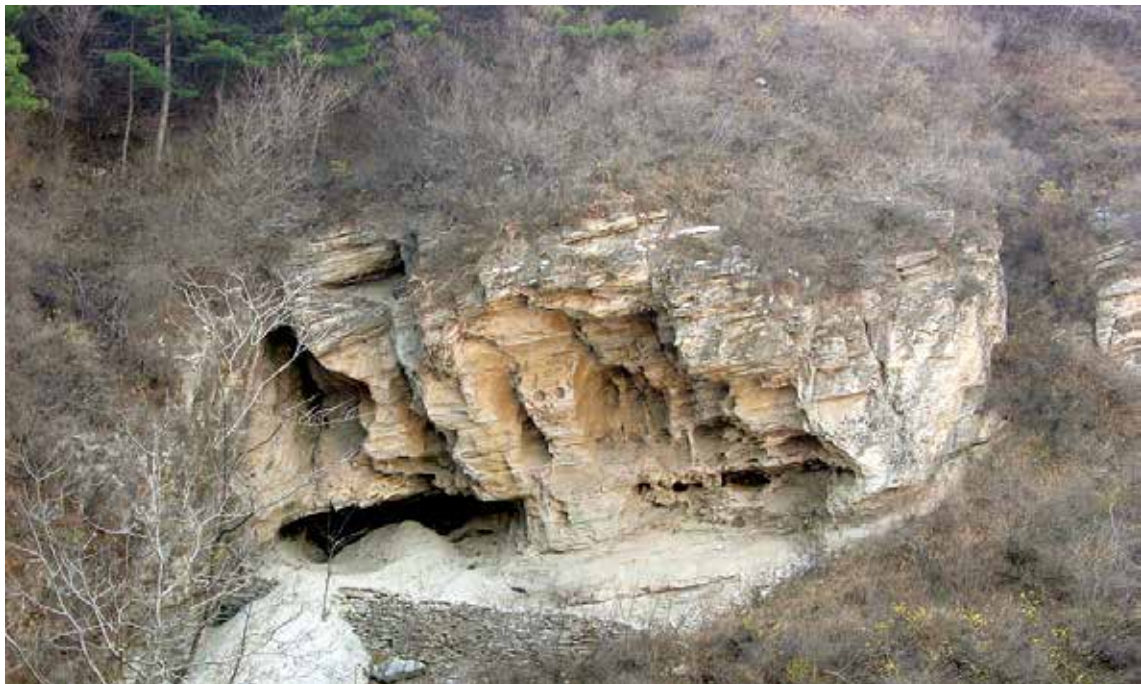
The entrance to the Tianyuan Cave.

The Tianyuan man was studied in 2013 by the same lab [6] . Then, they found that he showed a closer