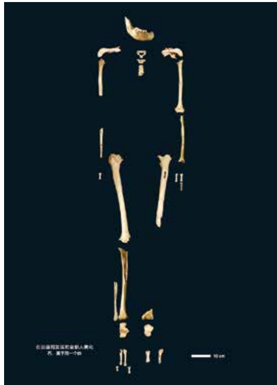
Skeleton of the Tianyuan man.

A second unexpected result shed some light on human genetic diversity in prehistoric East Asia. In 2015, a study comparing present-day populations in Asia, the Pacific and the Americas showed that some Native American populations from South America had an unusual connection to some populations south of mainland Asia, most notably the Melanesian Papuan