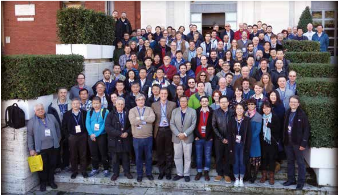
The First Science Meeting on High-throughput X-ray Astronomy and the eXTP mission was convened in Rome, Italy in February 2017.