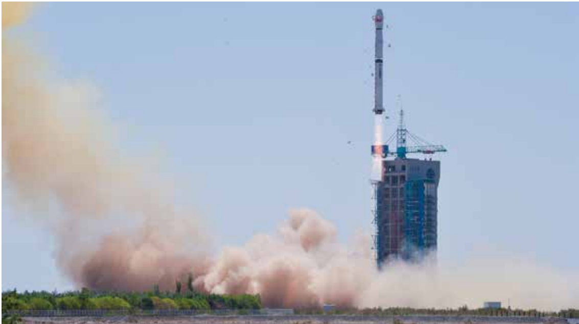
The Hard X-ray Modulation Telescope (HXMT, or “Insight”), China’s first X-ray Telescope, was launched from Jiuquan Satellite Launch Center in northwestern China’s Gobi Desert on June 15, 2017. It aims at mapping the hard X-ray sky and looking for new X-ray sources within the Milky Way Galaxy.

collimators into the detector and by swinging the detector in various directions, scientists can reconstruct the image of a specific source, and eventually render a map of the whole X-ray sky.