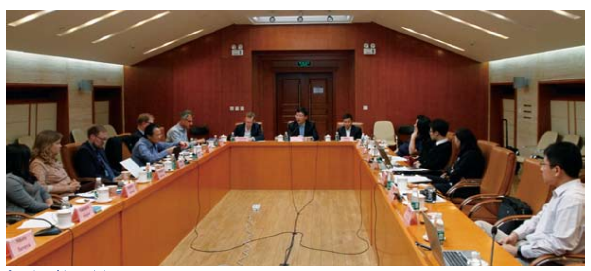
Overview of the workshop.

"While there are debates and research in environmental policy circles, as well as a controversial discussion of what it would take to keep future resource use within the limit of a finite planet," the co-organizers stated: "this discussion has not been transformed into comprehensive policy strategies in most countries so far. Neither has this happened in the industrialized world of the Global North which is historically responsible for most of the current