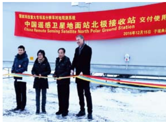
The inauguration ceremony of the CNPGS.

CNPGS is expected to enhance the transmission efficiency of satellite data and improve China's accessibility to global remote sensing data, which is of great significance in emergencies such as the aftermath of natural disasters.