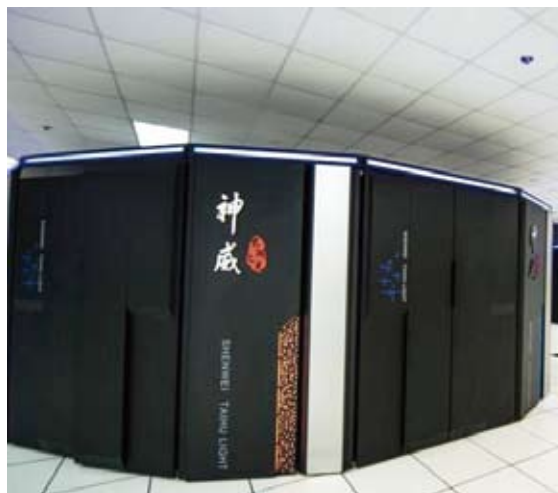
With a Linpack mark of 93 petaflops, Sunway TaihuLight developed by the National Supercomputing Center in Wuxi became the world’s fastest supercomputer in June 2016.

The Gordon Bell Prize, presented every year at the Supercomputing Conference, was established in 1987 by Gordon Bell, a pioneer in high-performance and parallel computing. It tracks the progress of parallel computing and rewards innovation in applying high performance computing to challenges in science, engineering, and large scale data analytics. (Based on Xinhua news release)