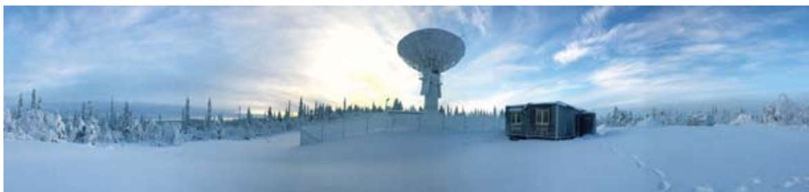
A beautiful view of the China Remote Sensing Satellite North Polar Ground Station.

It is also the first engineering application of the three-band antenna technology for China. It is capable of receiving all-weather, all-time, and multi-resolution satellite data, and is compatible with follow-up Ka-band receiving requirements. The construction of CNPGS has led to breakthroughs in many key technologies, such as a large-scale three-axis antenna structure system. As a light, modular, low-temperature, easily disassembled and unmanned system, it can perform remote fault diagnosis and maintenance.