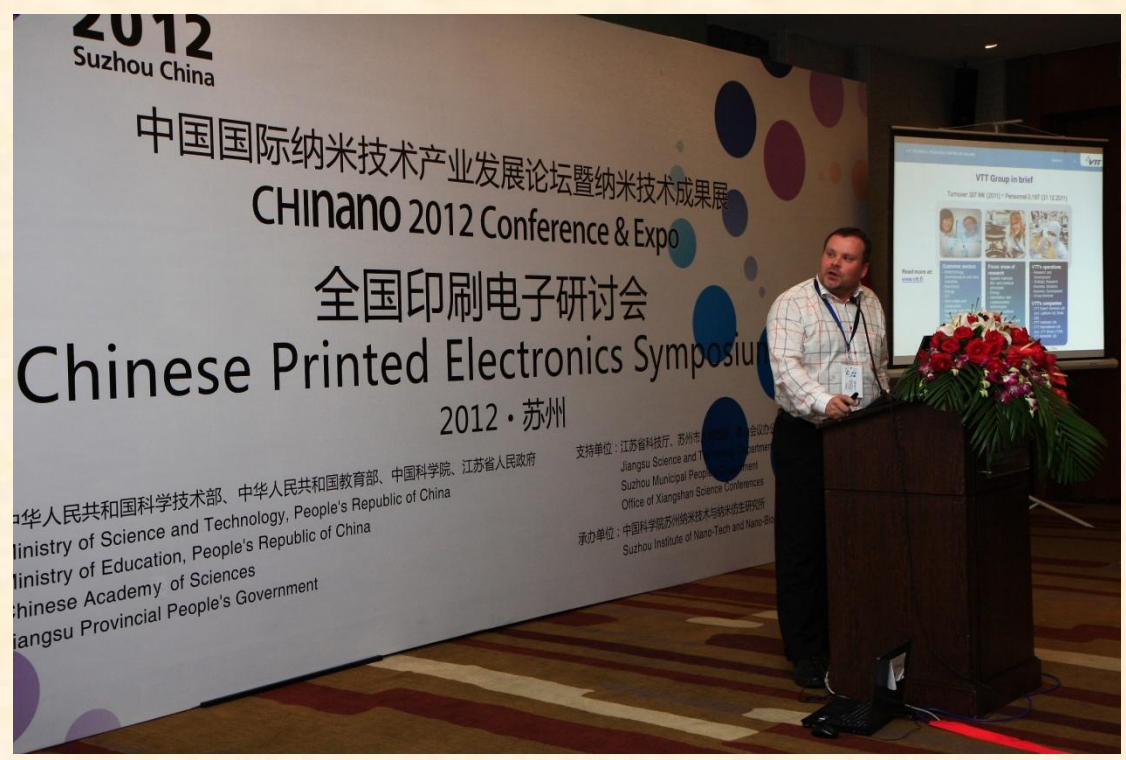
Invited speaker of the 3<sup>rd</sup> Chinese Printed Electronics Symposium (PEChina2012)