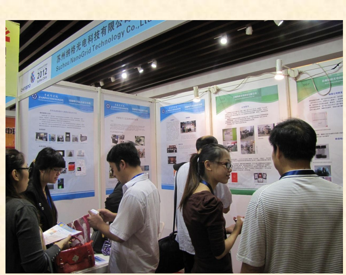
Industrial exhibition of Printed electronics in parallel to the 3<sup>rd</sup> Chinese Printed electronics Symposium (PEChina2012)