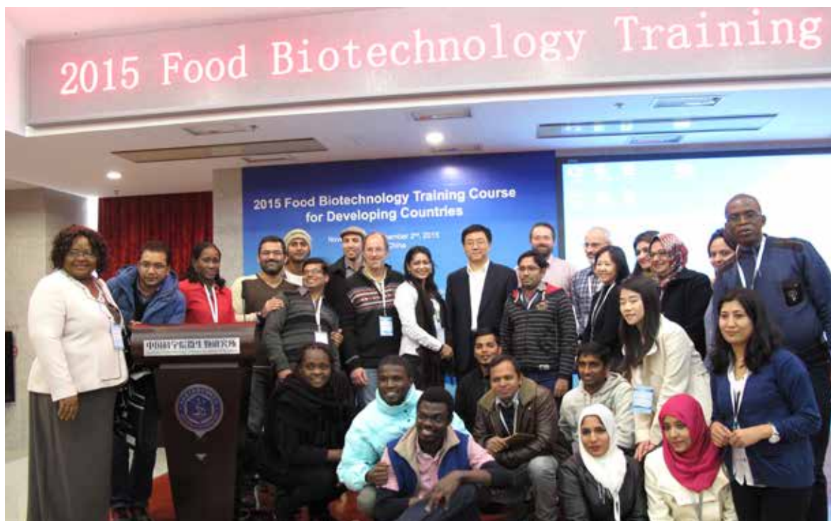
After announcement of the workshop winners, some trainees cannot help joining the lecturers for a group photo.