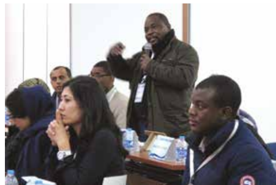
A trainee-lecturer discussion.