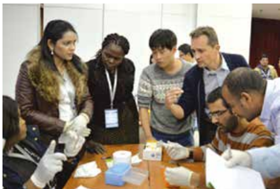
Trainees learning how to extract the LAB strains from yogurt and pickled vegetables to prepare for PCR samples.