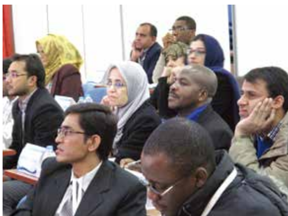
Trainees in class.