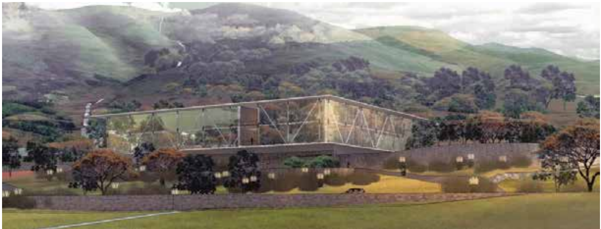
A conceptual design for the future NAOC Chile headquarters near Santiago.

Since its early operations, CASSACA has managed a Postdoctoral Fellowship program together with National Commission for Scientific and Technological Research in Chile. This Fellowship is aimed at providing young scientists, regardless of their countries of origin, with opportunities that draw upon the astronomical research strengths and facilities of both Chile and China. In the last four years, it has received more than 100 applications from all over the world and gained increasing recognition internationally as a significant fellowship in astronomy. A number of CASSACA's fellows have made breakthroughs in their