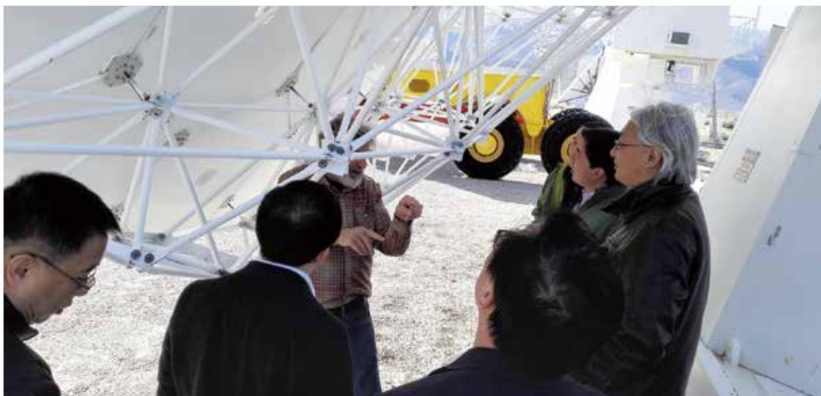
Chinese and Chilean scientists discussing a telescope project organized by CASSACA.

With the support of University of Chile, NAOC (CASSACA’s sponsoring institution) was granted the International Research Organization status in Chile by the Chilean government, through a presidential decree