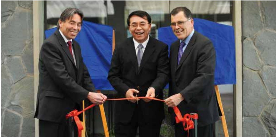
The inauguration of the CASSACA office in Santiago.