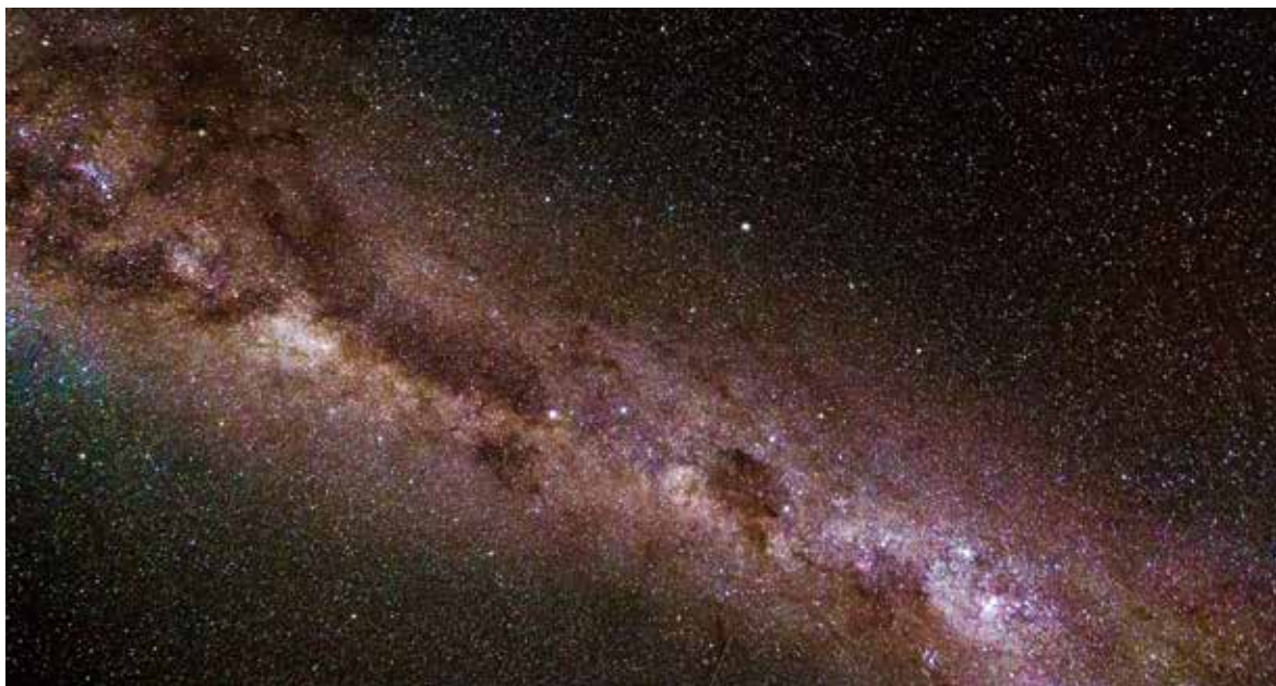
"Nation for the Stars:" By virtue of its unique geographic and atmospheric conditions, the Republic of Chile enjoys a very special position in observational astronomy. Shown here is a view of the Milky Way from the mountain-top of the Andes within its territories.

observatories stationed in Chile. It was inaugurated in Santiago in October 2013, and has been expanding its operations ever since. It now has a team of about 20, including science and administrative staff, long-term visiting scholars, postdocs and graduate students. CASSACA has built effective collaborations with a number of Chilean institutions, supported many young scientists, and developed mutually-beneficial research programs. In addition, it has worked on preparing for future development projects in Chile that are being contemplated by the scientific community in China.