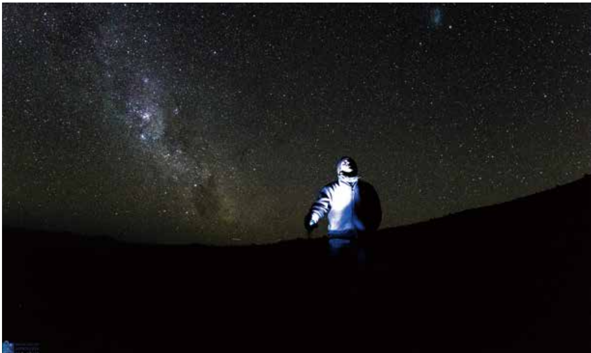
An astronomer is seen making observation from the top of the Andes in Chile. Glittering on the back is the Milky Way.

National Astronomical Observatories (NAOC) of CAS in Beijing, and it is hosted in Chile by the University of Chile's Faculty of Physical and Mathematical Sciences. CASSACA serves as a liaison for closer collaboration in astronomical research and related technology development with Chile and other South American countries, as well as with all other international