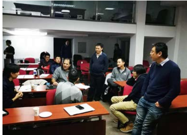
An informal discussion at the Workshop on CEPC Physics, which was held from December 13 to 15, 2016 by the Institute of High Energy Physics in Beijing.

For instance, how many Higgs do we actually need? To answer this question, we need to do calculations and work with the people who actually design the machine.