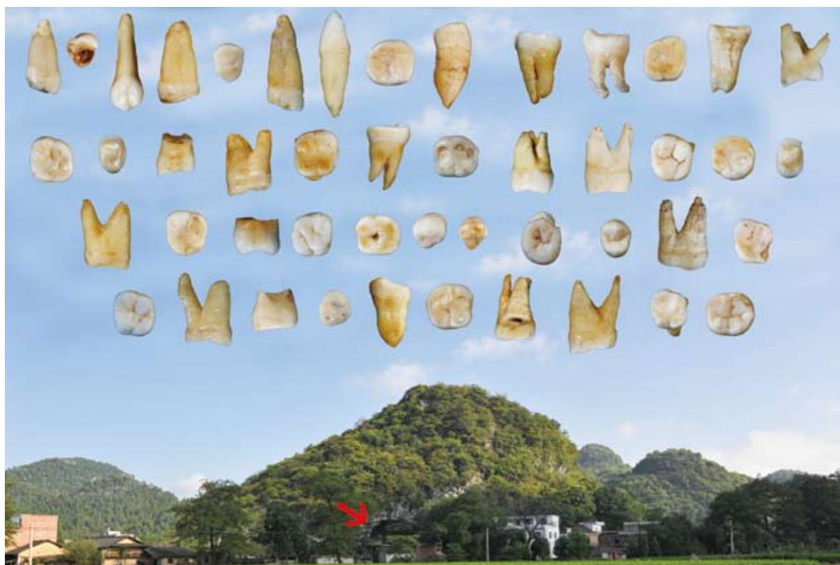
The 47 fully modern human teeth and the Fuyan Cave in Daoxian, southern China.

The hominin and most of the faunal elements consist exclusively of teeth, and many of them present root