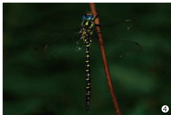
1. A female Cephalaeschna discolor . 2. A male Cephalaeschna discolor . 3. A male Cephalaeschna mattii . 4. A male Cephalaeschna solitaria .