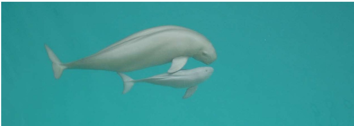
Figure 3. Picture showing the first born Yangtze finless porpoise in captivity in July 5, 2005, and his mother.

For porpoises to successfully breed in captivity, their physiological status, including serum reproductive hormones cycles, must be fully understood. Initially, we took monthly blood samples to evaluate the physical status of the animals, but have since found that this sampling interval is too long to allow hormonal changes to be effectively monitored. Therefore, after receiving additional medical training on the animals, we began collecting the samples we needed, such as feces, mouth saliva and blowhole secretion, on a daily basis or even at every feeding. We also established a laboratory protocol to use feces to evaluate the cycles of the animal's serum reproductive hormones. Growth continued to be monitored monthly and behavior was observed daily. Collectively, the results obtained indicate that the two animals that arrived in 1996 reached sexual maturity in 1999, and the animal that arrived in 1999 reached sexual maturity in 2002. They clearly began mating at a very early stage even before their